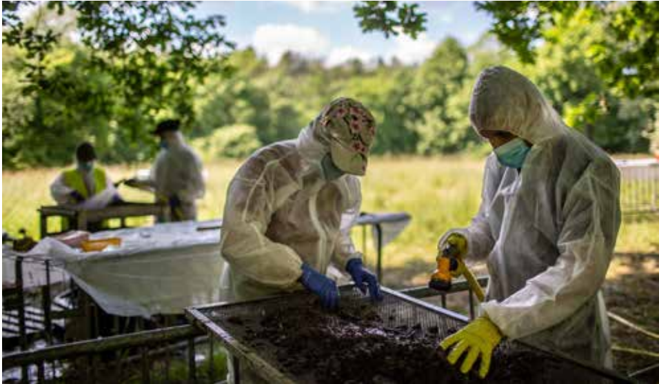
Fig. 7. During floatation of excavated soil with human bones found in 2021 in Death Valley