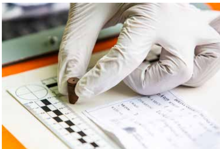
Fig. 10. Pistol shell – one of the artefacts found among the burnt remains of the victims murdered at the end of January 1945 in Death Valley

Part of the archaeological work consisted of collecting materials for specialist analysis. During the excavation, samples of wood and charcoal were taken, the analysis of which may shed light on the construction of the pyre itself and the fuel used to burn the victims' bodies. The soil in and around the cremated human remains was the subject of geomorphological and palynological research in order to reconstruct the local environment before, during and after the murder. In turn, geochemical analyses will be used to resolve the fundamental question: are the discovered pits containing human remains the place of burning the victims' bodies or just the place of its deposition?