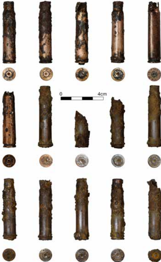
Fig. 14. Rifle cartridges of the Mauser system found in Death Valley

human remains, dimensions of mass graves and exhumation pits can be seen as important sources of knowledge about the past. Through these small, rusty, damaged objects, some of the key aspects of the German crimes of 1939 and their legacy in the pre-war Pomeranian Voivodeship can be reconstructed. Here, archaeology becomes a way of collecting the evidence of crimes – forensic archaeology (Sturdy Colls, 2015) (fig. 14–15). An Archaeology of the Pomeranian Crime of 1939 is another example of this approach.