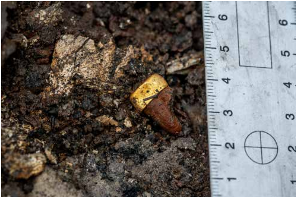
Fig. 9. A field photo of a tooth with a gold crown found during field research in 2021 in Death Valley. The white structures in the background of the photo are burnt human remains

According to the testimonies, the victims were taken from the buildings of the National Social Welfare Institutions to Death Valley. In total, two seasons of field research have uncovered a large collection of cartridge cases and most likely from Walther PPK and P08 Parabellum pistols – ballistic analysis is in progress at the time of writing (fig. 10).