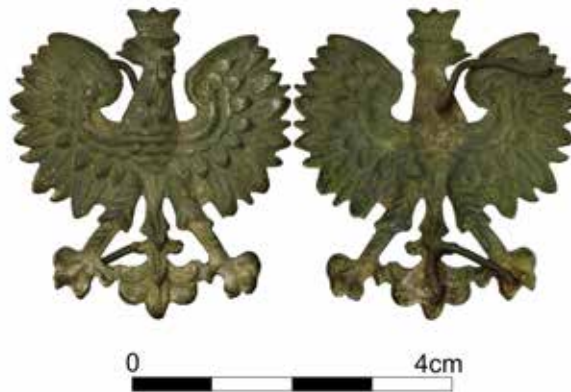
Fig. 15. An eagle from a railway cap, dating from the Second Polish Republic period, found in Death Valley. Railway workers were also among the victims murdered in the autumn of 1939 near Chojnice