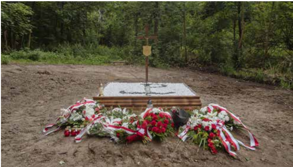
Fig. 16. August 1 st , 2021 – official laying of flowers at the site of the mass murder from the end of January 1945, which was discovered in 2020 in Death Valley, and exhumed a year later

Analysis of the recovered bones, artefacts, wood and charcoal from the cremation pyre, soil samples and artefacts in general will continue over the coming months. It is only a matter of time before the next victims are identified. Investigations of this kind, such as those in Death Valley in Chojnice, show that even several decades after the murder and despite strenuous attempts to cover up the traces of the crime, there is still a chance of finding the remains of murdered people who were supposed to remain nameless forever, buried in the ground forever (fig. 16). Chojnice 1939–1945 is also an important and mostly up-to-date description of the German terror during World War II in Chojnice and the region.