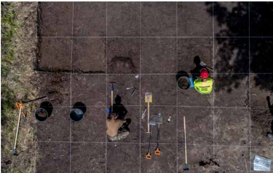
Fig. 8. Aerial photo showing the excavation grid, which was the basic method of inventorying discovered human bones, artefacts, wood and charcoal during fieldwork in 2021 in Death Valley