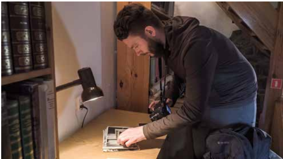
Fig. 3. During the archival query of the collections of the Historical and Ethnographic Museum of Julian Rydzkowski in Chojnice

The second pillar of the work carried out in 2020 focused on the ethnography of Death Valley, e.g. conducting interviews with people who lost their family members on the outskirts of Chojnice in the autumn of 1939. In fact, ethnographic research was a very important social and cultural component of the work. On the one hand,