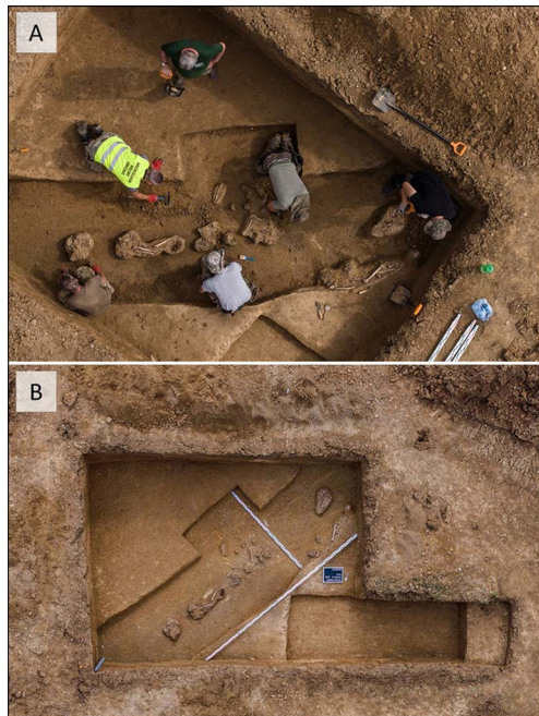
Figure 3. Mass grave in Death Valley: A) excavating the grave; B) aerial photograph of the grave.

physically cover all evidence of the crimes; any associated documents had already been burned and destroyed by the end of November 1939. During the second half of 1944, a special Nazi commando had the task of locating mass graves in Gdańsk Pomerania, exhuming the corpses of victims and cremating the remains (Hoffmann 2013).