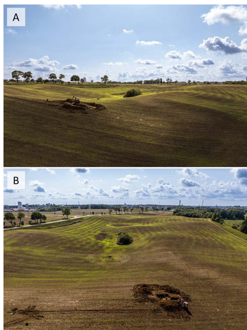
Figure 2. Death Valley: A) opening the trench; B) location of the trench in the local landscape.