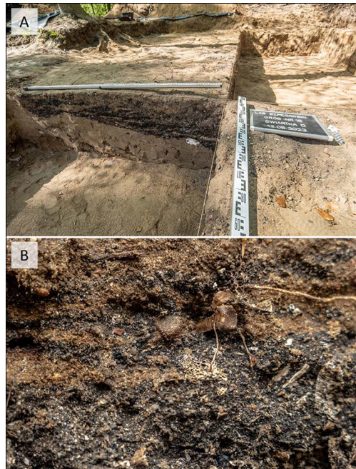
Figure 5. Mass grave in the Szpegawski Forest: A) excavating the grave; B) close-up of the layer consisting of burned human remains, artefacts and charcoal.