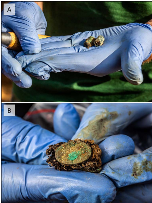
Figure 4. Material evidence of the crime in Death Valley. A) pistol casings; B) a gold-plated cufflink.

The second mass-execution site examined in 2023 was in the Szpegawski Forest, where a reported 2413–7000 human beings were taken and murdered by the Germans between September 1939 and January 1940. That mass execution also targeted members of the local intelligentsia, the mentally ill, general labourers and farmers, among others (Kobińska et al. 2024).